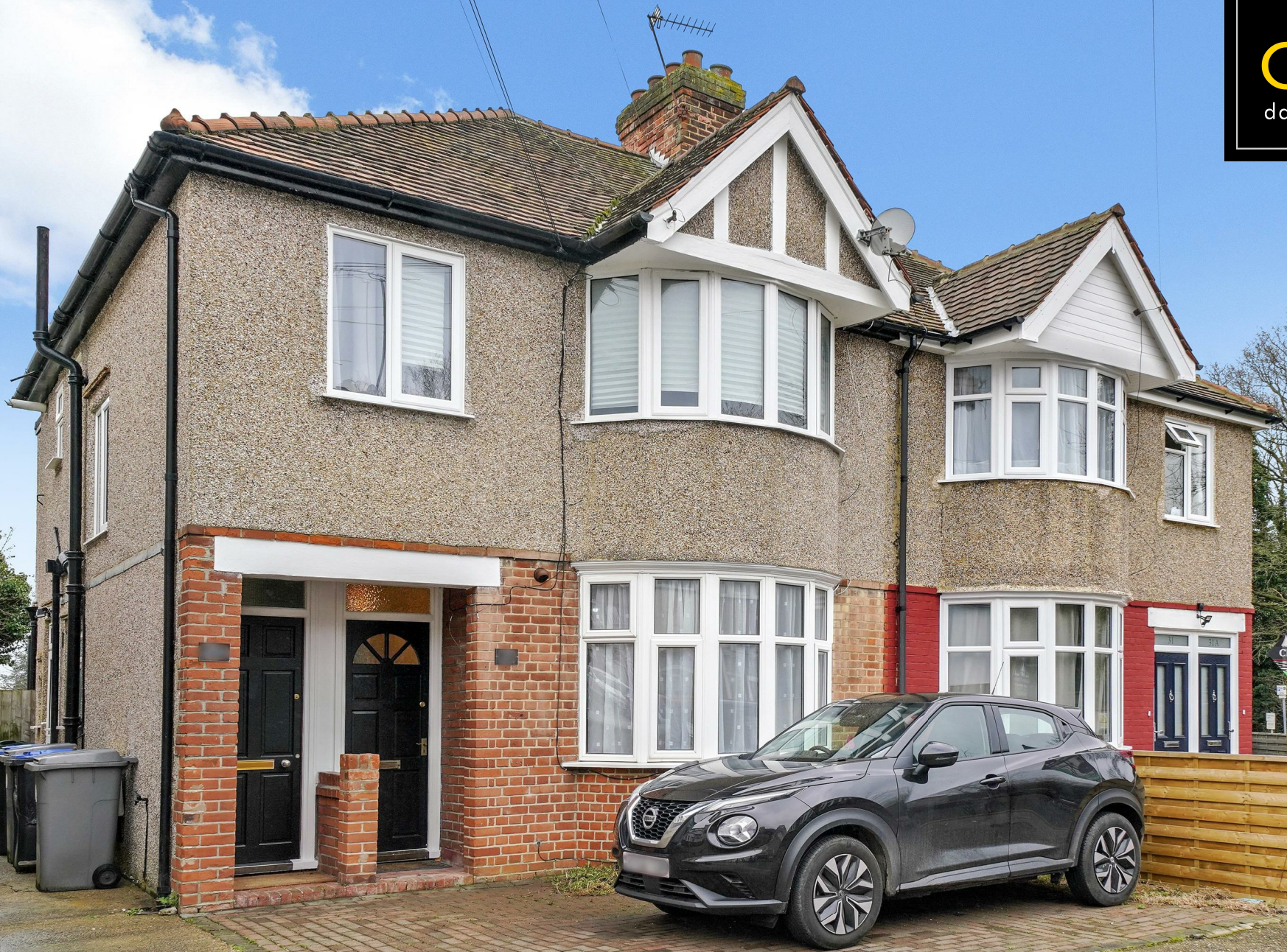
The Croft, Wembley, HA0 3EQ Asking Price £400,000